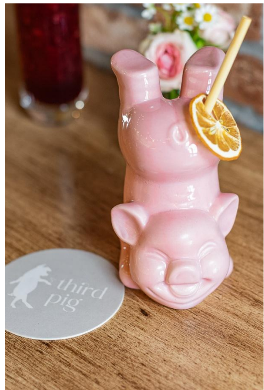
Piggy Punch at Third Pig Bar in Sebastopol. (John Wesley Brewer)

Back downtown, stroll past the shops before seeking out playful vibes at neighborhood standout Third Pig Bar (116 S Main St.), where craft cocktails come served in vintage glassware or — our favorite — a pink pig tiki mug.