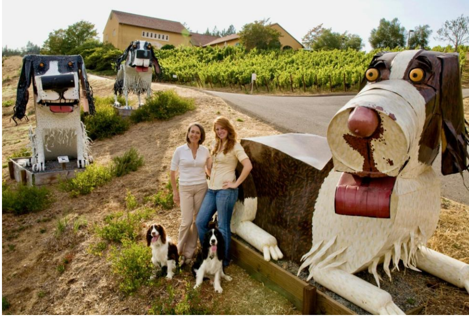
Marimar Estate Vineyards & Winery in Sebastopol.